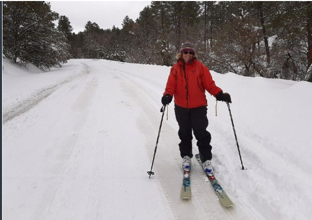
A cross-country skier on White Spar Road in Prescott, Jan. 2021