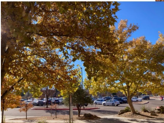
Sycamore trees at the Family Enrichment Center