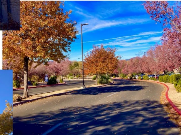
Bradford Pear & Autumn Blaze trees along main drive at Prescott Campus