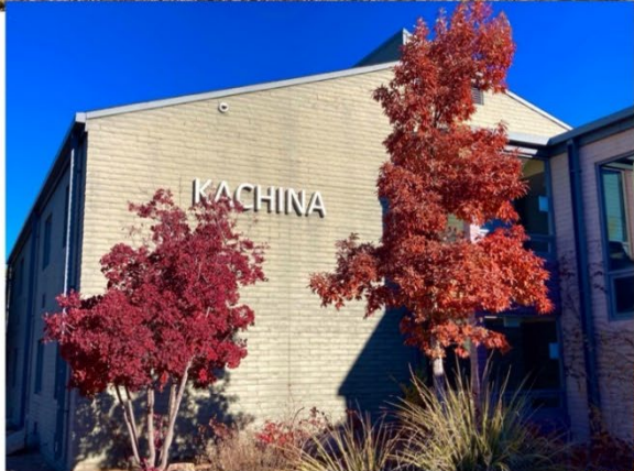
Smoke & Oak trees hiding behind Kachina Hall