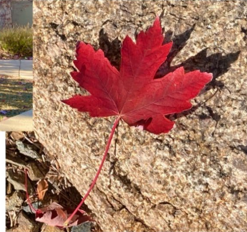
Maple leaf in front of the Art Gallery