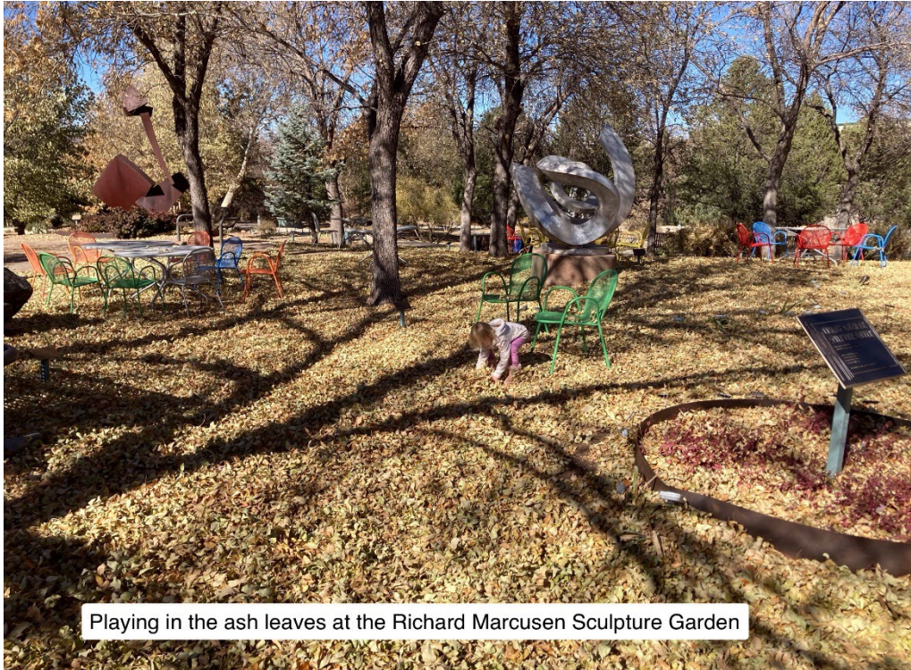
Playing in the ash leaves at the Richard Marcusen Sculpture Garden

Fall is upon us! For the Grounds team that means full parking lots, cold mornings, and lots of questions. The number one question I am asked is “What are those amazing trees along the road called?”. Once the leaves start changing colors these guys get pretty popular and for good reason. The Autumn Blaze Maple has a name that is pretty much right on the nose. Despite all of the arborist negativity surrounding these trees (girdling root, weak limbs, etc.) they do surprisingly well in this area. I personally find their biggest drawback lies in their claim to fame. That bright-shocking fall foliage can become redundant in some small or simple landscapes. Definitely not a problem for us here at YC.