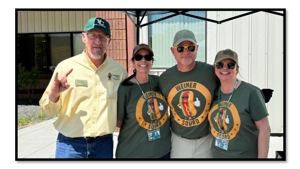
The CTEC Weiner Squad